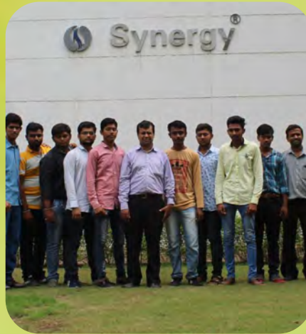
Synergy Agro –Tech PvtLtd More than 25 Students

Student Site Visit-Nirma University 18th November 2017